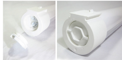
Tool-free fast wiring